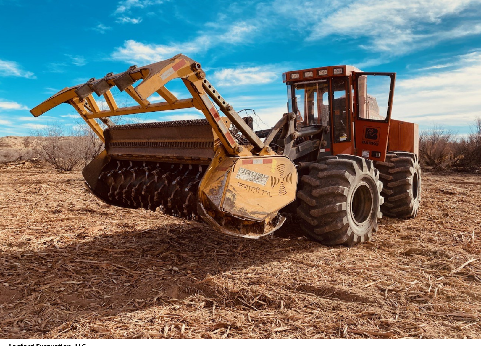
Lanford Excavation, LLC